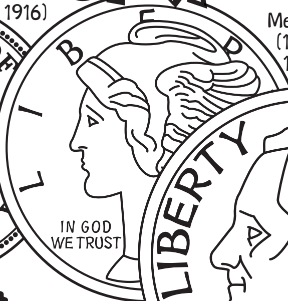
IN GOD WE TRUST